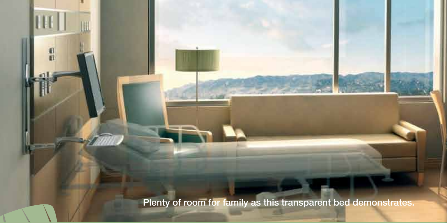
Plenty of room for family as this transparent bed demonstrates.